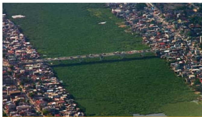
Pollution in a river that flows into Laguna de Bay, near Manila.

Nitrogen fertilisers and intensive livestock farming are a major source of nitrate pollution in water bodies. One example is that of Laguna de Bay, a large lake near the Philippine capital Manila. Intensive farming practices relying on chemical fertilisers were introduced in the surrounding areas in the 1970s. A decade later excessive run off of nitrates had caused severe eutrophication and algal blooms in the lake. The marine life of the lake was being steadily suffocated. The Philippine Government has taken steps in recent years to tackle the pollution, which is also caused by effluent from factories and the release of untreated sewage from adjacent residential areas, but the problem still persists. The situation is a major concern for the lake's aquaculture industry, which supplies the nearby capital with fish. A recent survey conducted in China looked at the level of nitrates in groundwater at 600 sites in 20 counties where the level of fertiliser use in agriculture was high. It found that at nearly half of the sites nitrate levels were above 50mg/l, which is the maximum safe level in developed countries. High levels of nitrates and nitrites in drinking water can cause 'blue-baby' syndrome. 30