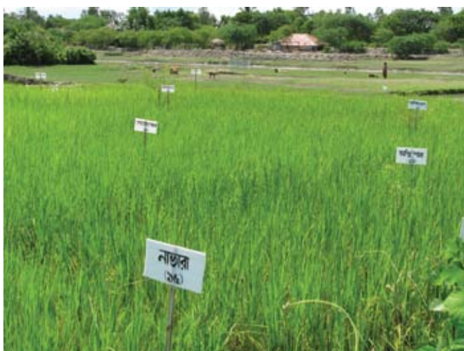
Local rice varieties being multiplied by farmers in a field in west Bengal, India. Christian Aid partner DRCSC works through a network of local training centres in the state to promote the adoption of sustainable agriculture.

What follows is a more detailed description of just three of the techniques listed Table 2.