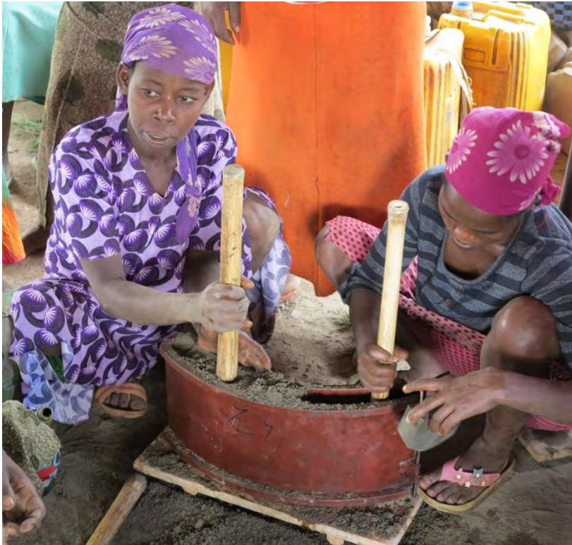
Women participating in improved cook stove production, Konso Zone, SNNP Region