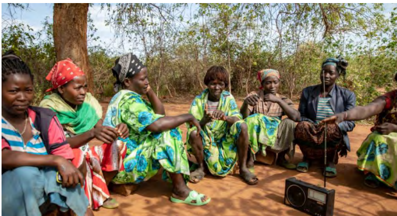
Women's radio listening group in Bena Tsemay woreda, South .Omo zone , SNNP Region, Ethiopia

In addition, due to resilience building interventions, such as establishing community organisations and rural climate finances, economic and social empowerment of rural households were observed. This helped to significantly improve gender dynamics both at household and community level. Based on mid-term and final evaluations of the project, those who are economically empowered were found to be in a better position to respond to the impact of climate extremes.