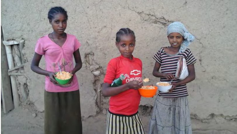
Adinsho Kori primary school students having school lunch provided through the Band Aid funded programme, Zuway Dugada district, April 2019.

The school feeding programme was successful in supporting vulnerable families who are unable to provide food and send their children to school.