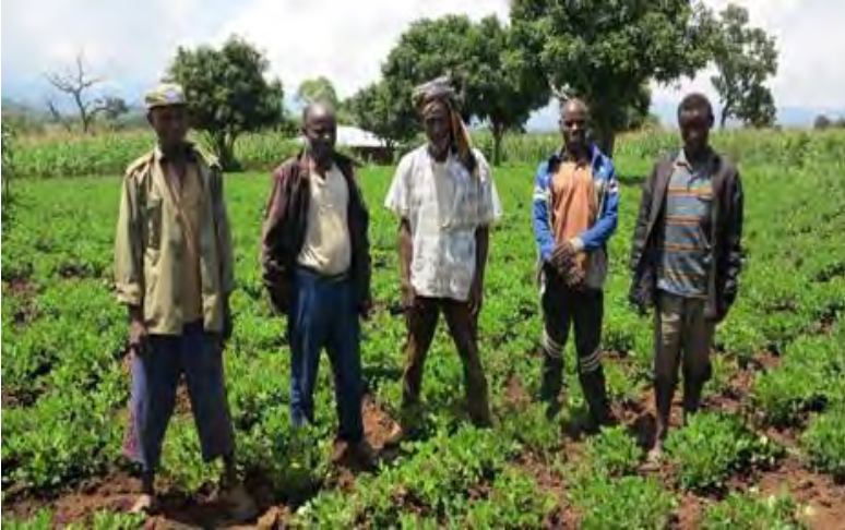
Smallholder farmers growing peanut in Chawaka Woreda, Oromia Region