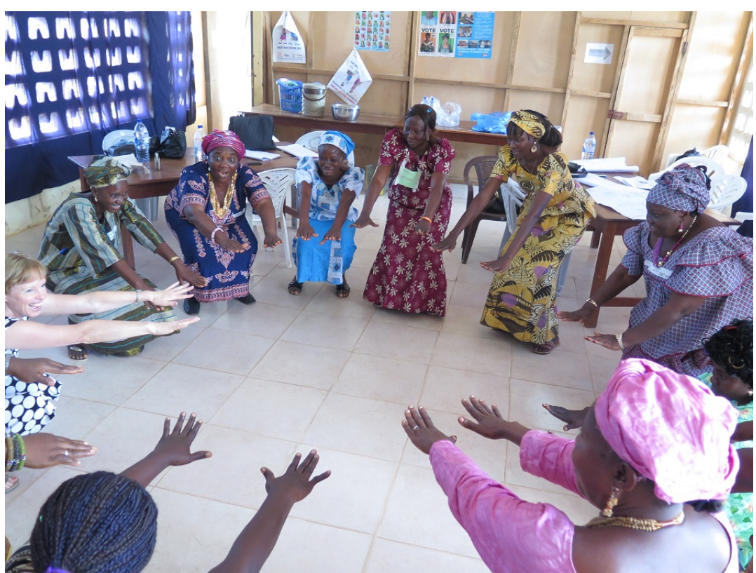
Network members and the research team take a welcome stretching break during a workshop in Kailahun, September 2015.