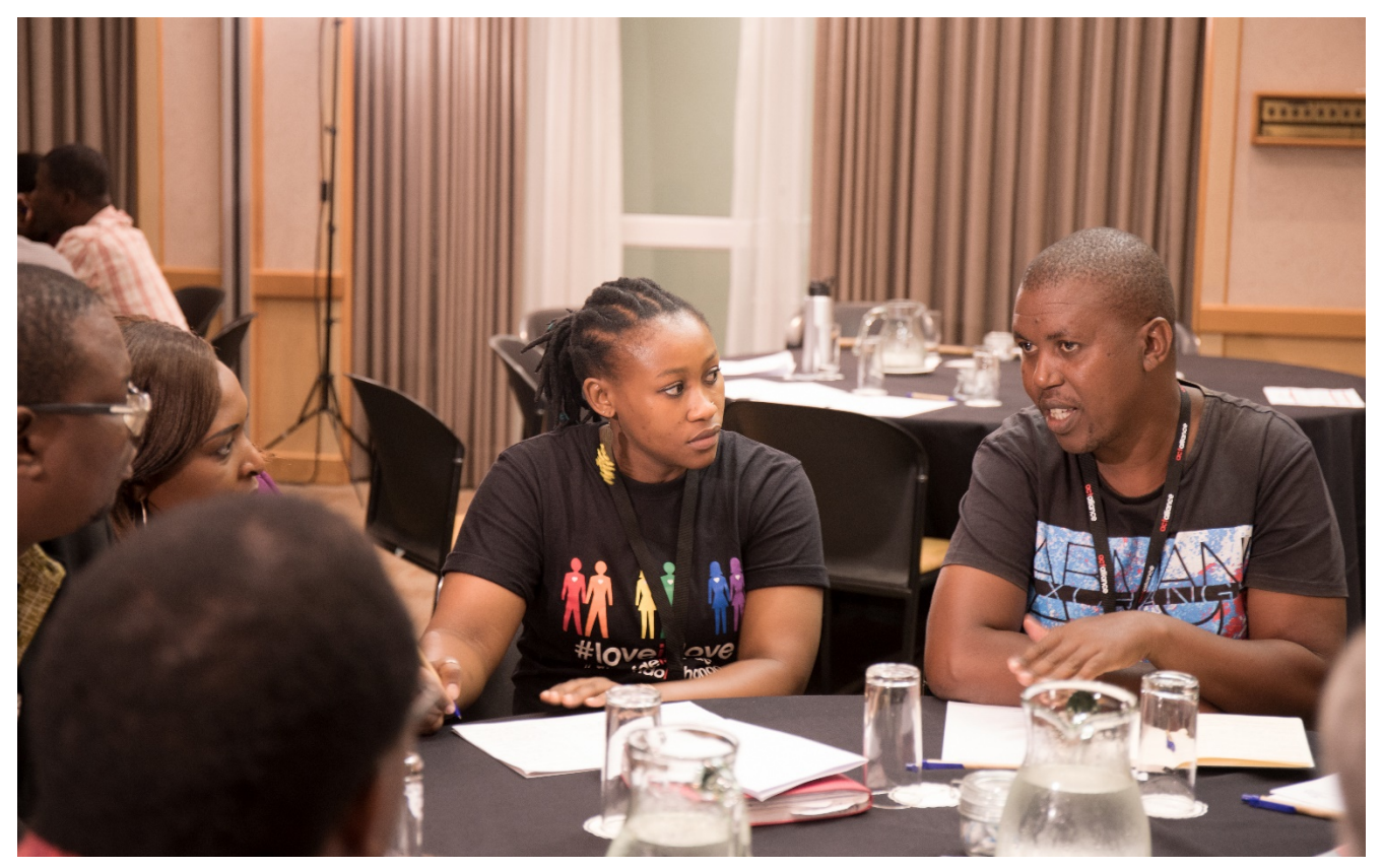
Community activists at a 2018 ACT Ubumbano community learning exchange event in Johannesburg, South Africa sharing experiences, knowledge and tactics with other activists.

By March 2020 ACT Ubumbano had registered officially. The advisory group of eight Southern African partners and three E8 partners had evolved to become the ACT Ubumbano board, with the Southern African partners in the positions of chair, vice chair and secretary. Work is still under way to further clarify the distribution of power between staff, board members and ordinary members. For example, discussions are ongoing as to how the board is selected and who the representatives should be. The model is jointly owned by northern and southern members, but its agenda is driven by the Southern representatives.