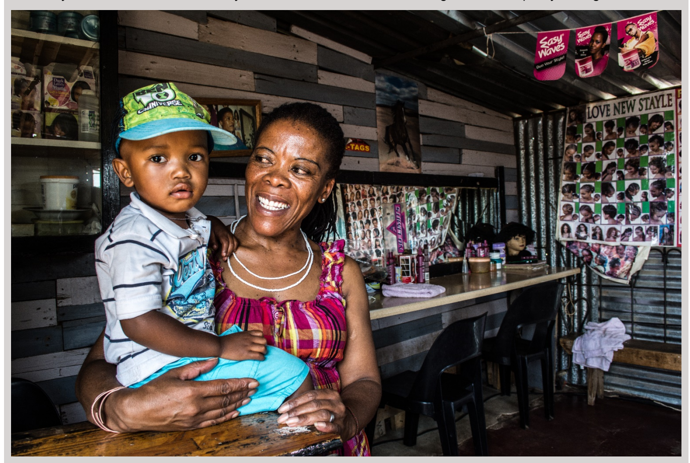
A woman who was supported by the Studies in Poverty and Inequality Institute (SPII) to strengthen her own business within a shackdwelling community in Evaton, near Johannesburg, South Africa. SPII, a think tank set up in 2006, provided trainings to small enterprises such as hers, including financial literacy and business management skills, and mentoring, which also served as evidence for local government policy recommendations.

Studies in Poverty and Inequality Institute (SPII) is a research think tank set up in in 2006. It has a cross-sectoral approach, bringing together policymakers, academics and CSOs to identify gaps in knowledge and to carry out research on poverty and inequality to inform policy in Southern Africa. SPII is well positioned to be both nationally influential and internationally relevant, and is involved at the highest level of policymaking.